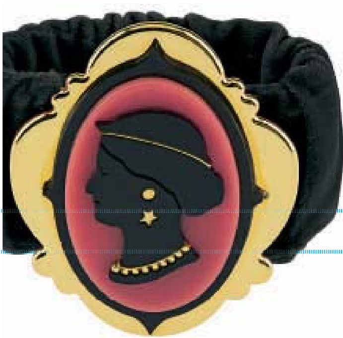
Traditionally cameos were carved out of semi-precious stone or shell; Miu Miu's come in gold and bright plexiglass. A quirky take on a classic, they look like becoming collector's pieces when they go on sale on 1 March. £450; miumiu.com