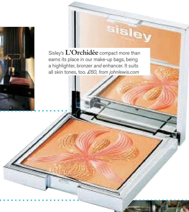
Sisley's L'Orchidée compact more than earns its place in our make-up bags, being a highlighter, bronzer and enhancer. It suits all skin tones, too. £60, from johnlewis.com