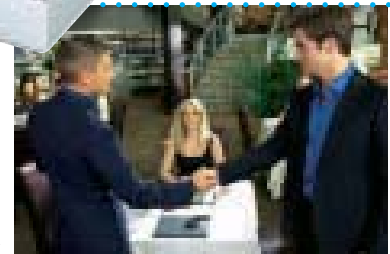
From the director of Charlie's Angels , This Means War is an action comedy about two CIA chiefs who go head-to-head after discovering they're dating the same woman, played by Reese Witherspoon. Out now